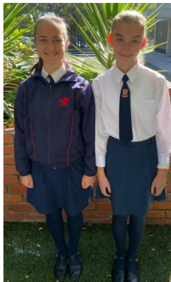
Gr 4 – 7